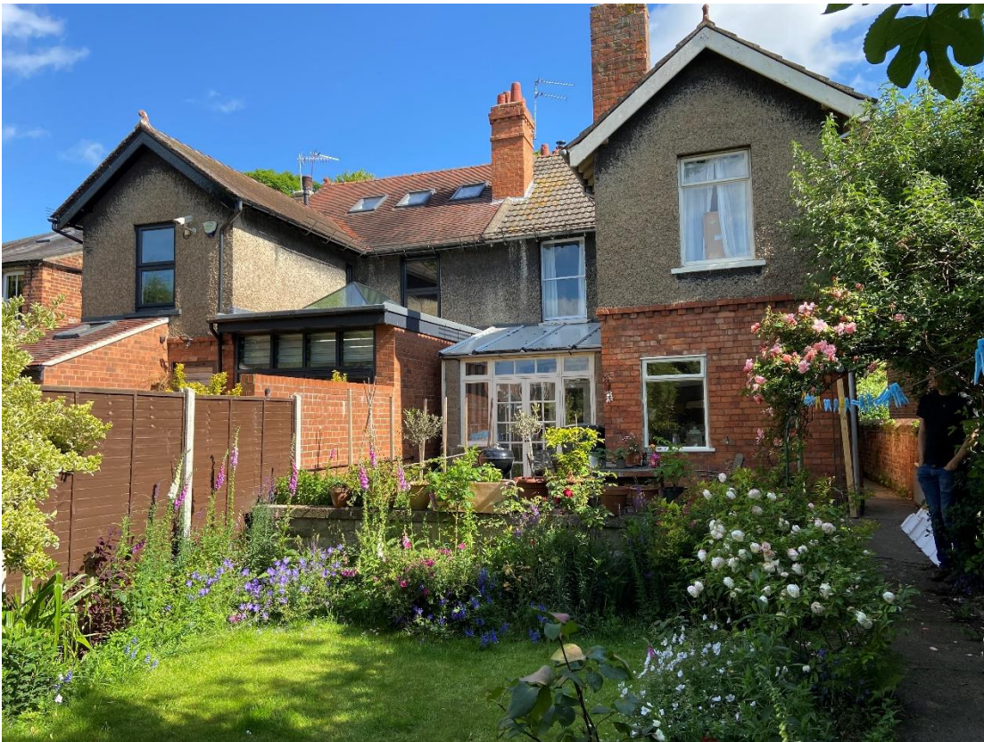
Rear elevation and side boundary with 19 Hamilton Road