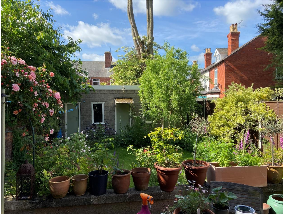
Rear boundary with 22 St. Catherines