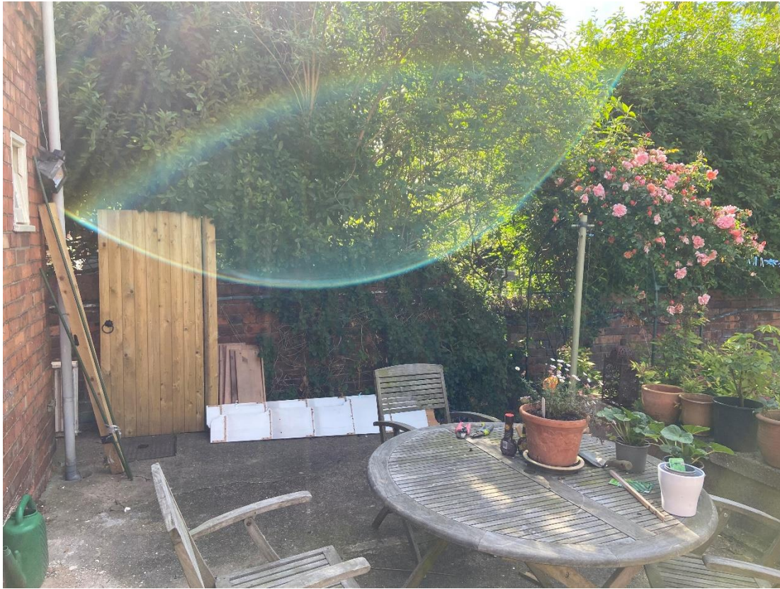
Side boundary with 15 Hamilton Road