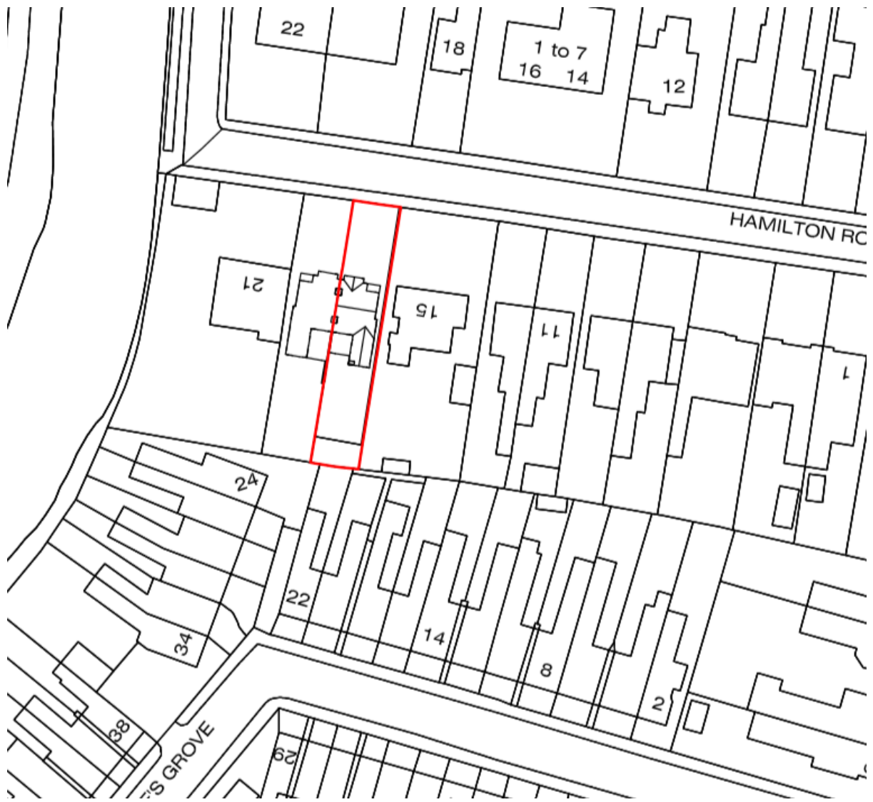
Site location plan